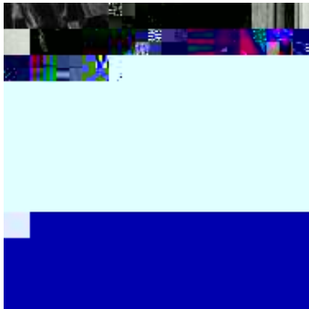
Athabascan woman stitching a birch bark basket.

Dené (Athabascan) basket makers are aware of birch bark's ability to hold water. They collect birch bark in the spring or early summer, taking only the outer layer so that the tree will survive. The bark is cut, warmed to make it flexible, folded into shape, and stitched together with split pieces of root from spruce or willow trees. Baskets are made in a variety of shapes and sizes for different purposes.